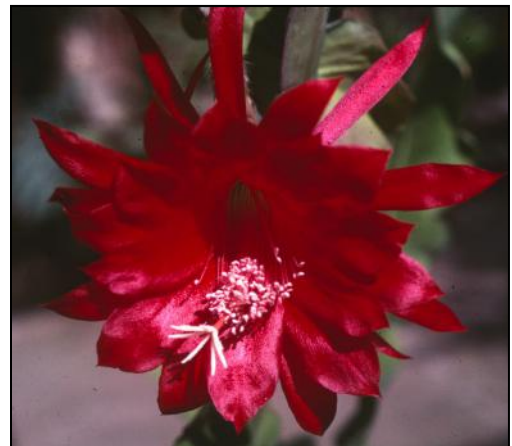
'Crimson Arrow'