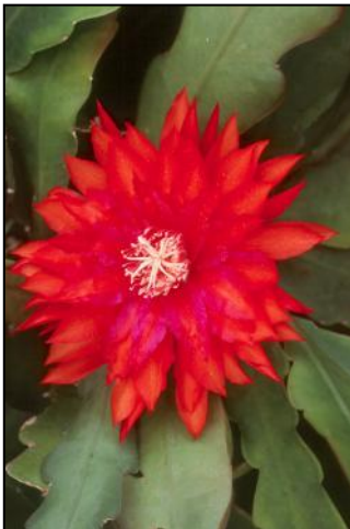
'Bea Barad' LAT