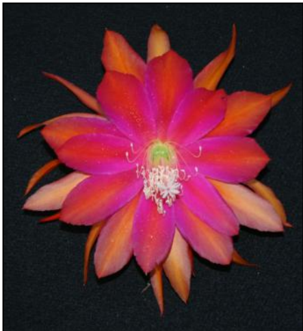
'Derby Star' FB