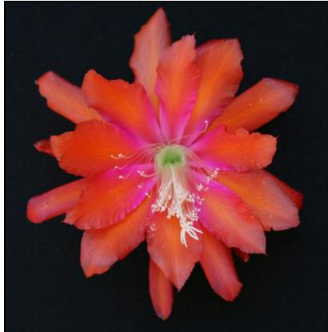
'Crowning Glory' FOB