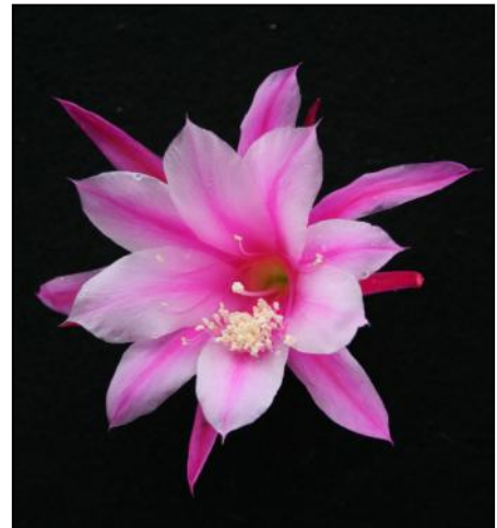
'Diana Inglese' LMD