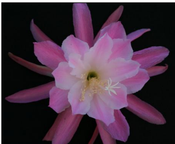
'Happiness Is' WC