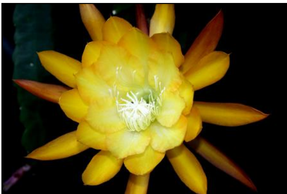
French Gold