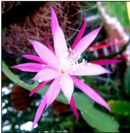
'Jalisco Grace'