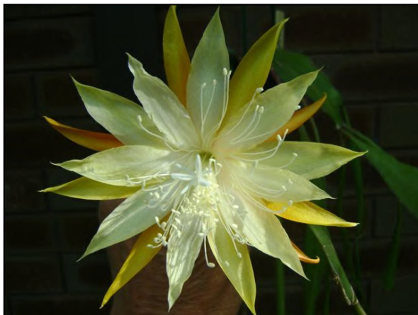
'Fred Boutin'