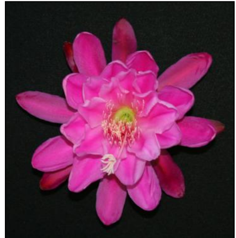
'Cranberry Puff' DP