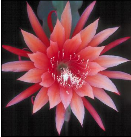
'Golden Jubilee' FOB