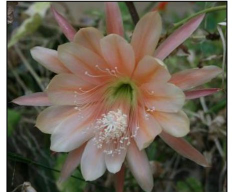
'King Midas'