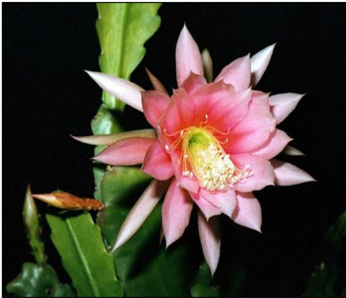
'Argus'