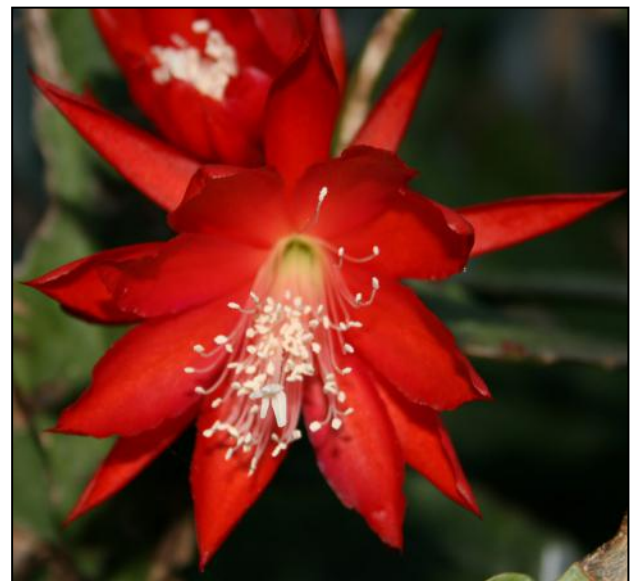
‘Happy New Year’

For the up to date calendar check out: http://sdepis.org/news-information/calendar/