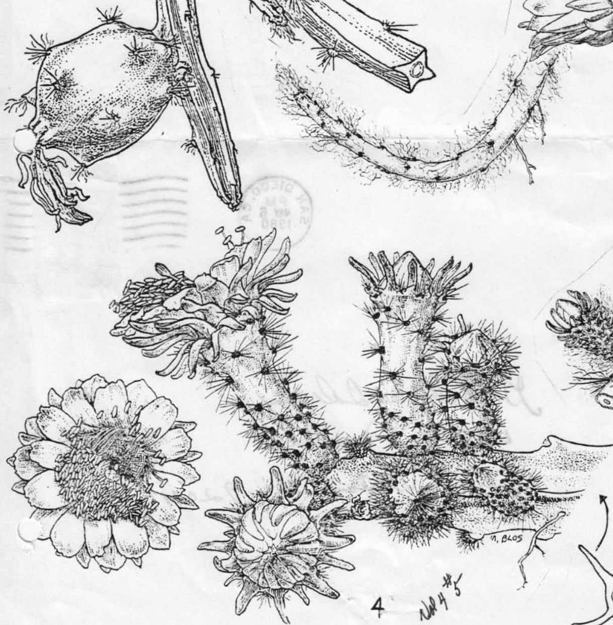
Weberocereus tonduzii Sterile and flowering stem-apices